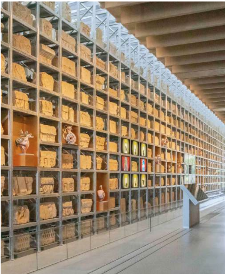
Lapidary Gallery with the XII Calls — Narbo Via Museum