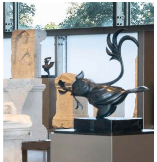
XII Calls