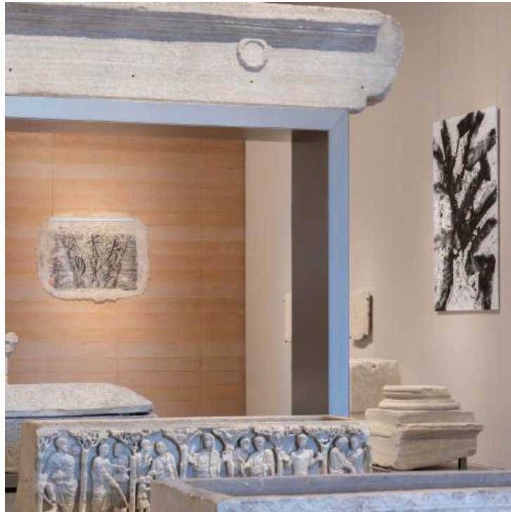
Paintings – Her Voice, Bravery