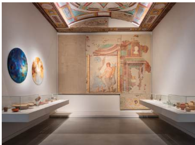
Angels of the Caves, The Sky and The Earth