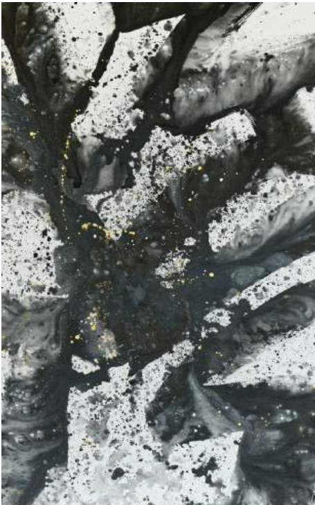
Painting on canvas – Her Voice, Bravery

This unprecedented encounter between two writing systems, two civilisations and two cultural memories offers a poetic reflection on the ways art reveals and reinvents cultural heritage.