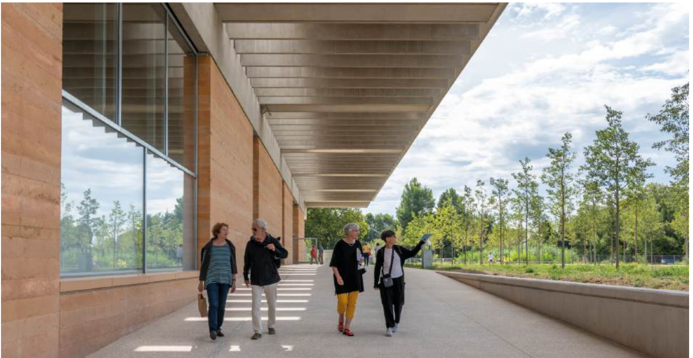
Narbo Via Museum

Since 1 February 2020, Narbo Via has been managed through a partnership governance model within a Public Cultural Cooperation Establishment (EPCC), bringing together the French State, the Occitanie / Pyrénées-Méditerranée Region, the Greater Narbonne urban community and the City of Narbonne.