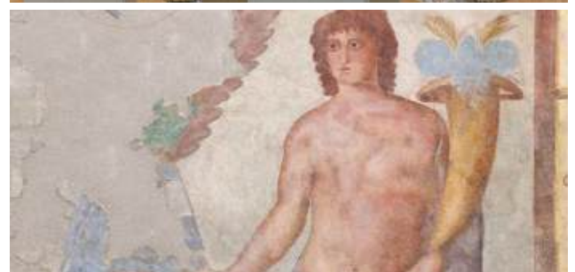
Lapidary Gallery — Narbo Via Museum