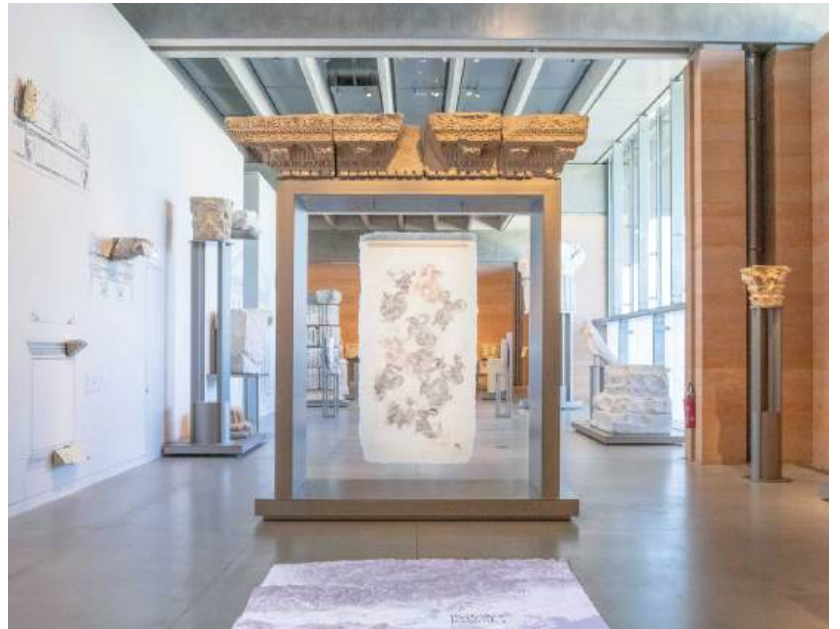
XII Calls ©QEJ Studio