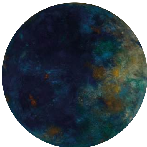
Angels of the Caves, The Sky

This representation of time enters into close dialogue with the archaeological artefacts of Narbo Via, themselves marked by wear, stratification and fragmented narratives.