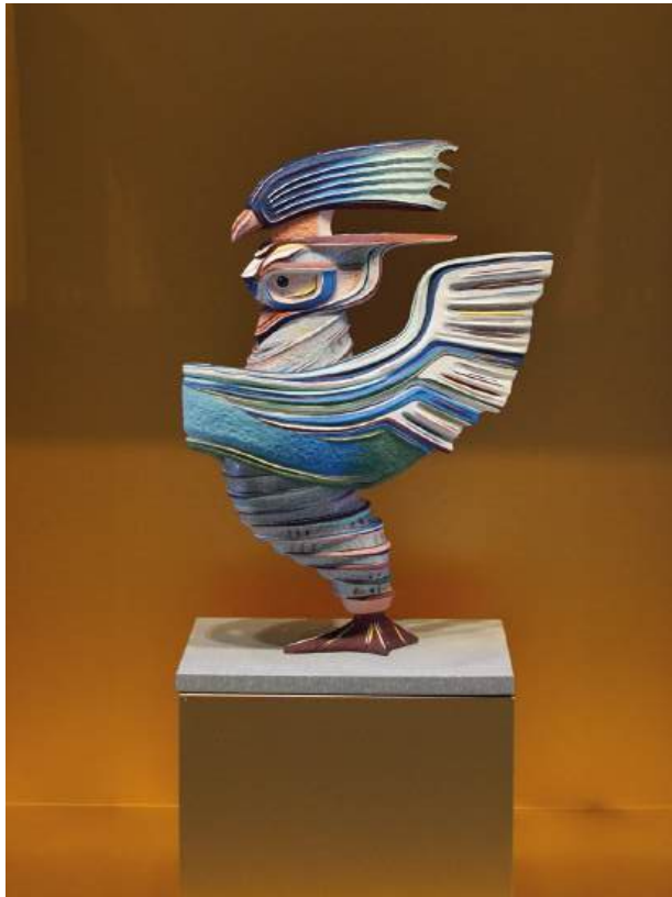
Inclusion , one of the XII Calls , are rendered in mineral pigments.