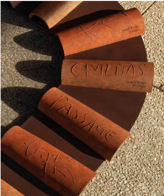
Sky & Earth