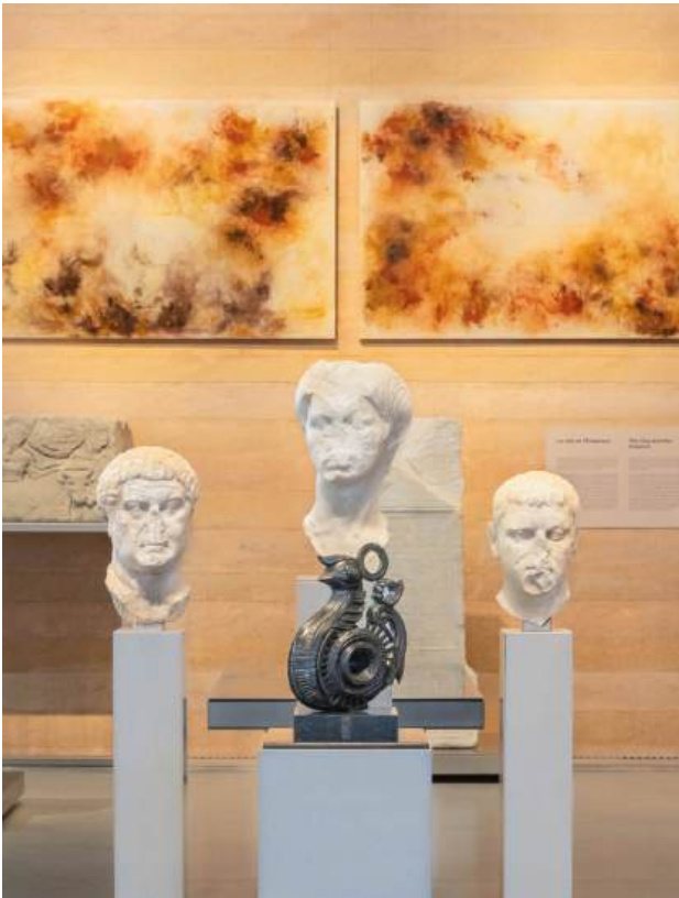
Painting, Angels of the Caves and Time one of the XII Calls in bronze ©Qiting Lin